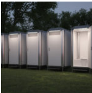
Sandati Cabinets at night