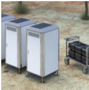
Sandati Cassette Solution