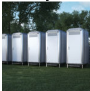
Sandati Cabinets at day