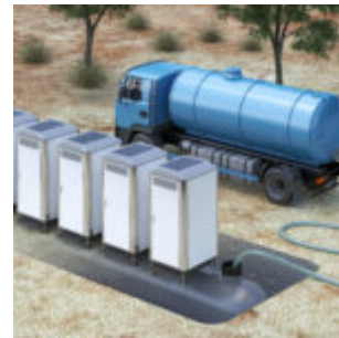
Sandati Septic tank Solution