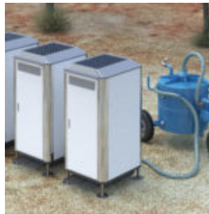
Sandati Sewage Solution